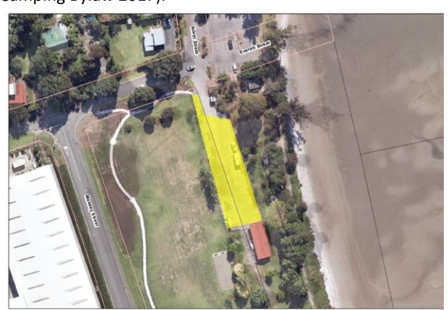
Figure 14: Vehicle camping areas at Motueka Beach Recreation Reserve car park, as at May 2019.

Currently, overnight camping in self-contained vehicles for a maximum stay of two nights is permitted within the formed parking area located in the northern/central area of the reserve, as defined on Figure 14 (Council's Freedom Camping Bylaw 2017).